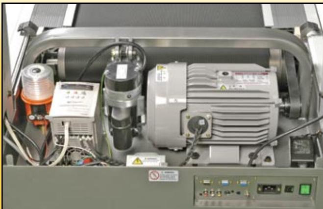
M990 Series Motor Compartment

Motus USA also introduces a new line of strength equipment, including Selectorized Circuit Equipment; Women's/Youth's Selectorized Circuit Equipment; Multi-Gym's; Plate Loaded Equipment; Free-Weights; Weights; Flooring and Pilates Equipment. Motus USA also has a full cardio lineup with regular LED displays for the more budget conscious consumers.